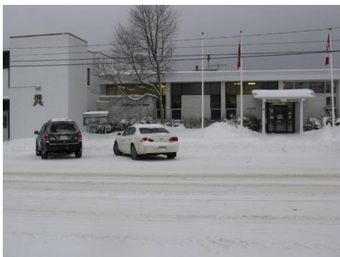
Winter view of town hall.

The gallery seating in Council Chambers will accommodate up to 30 guests with an excellent view of the ceremony.